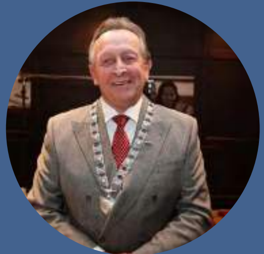
IPA Netherlands Gimborn Seniors