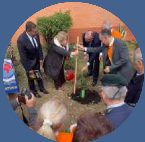
IPA Portugal Orange the World