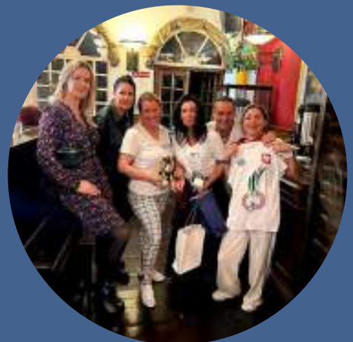
Study Visit of Polish Policewomen in Ireland