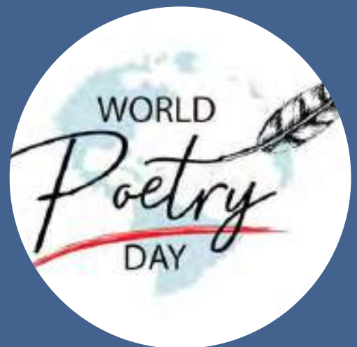
IPA World Poetry Day