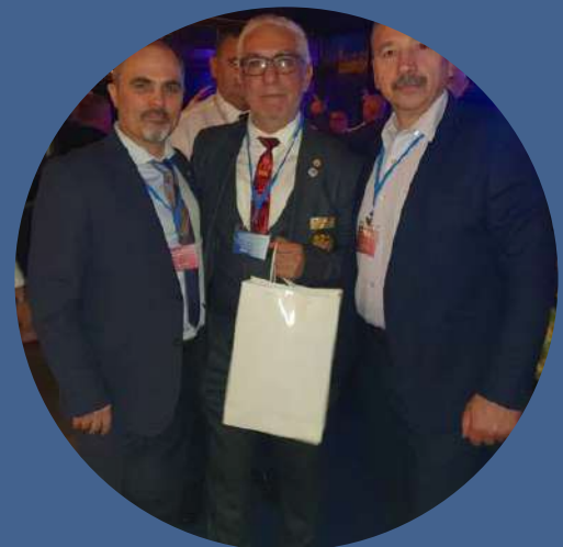
IPA Moldova Attend International Meeting