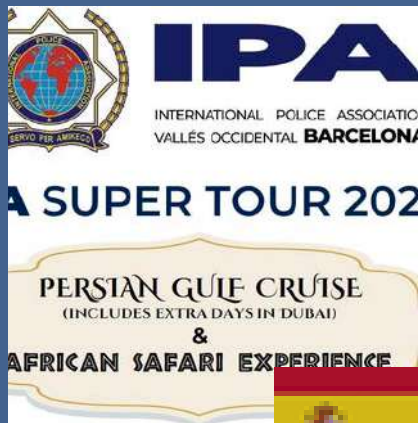
IPA Super Tour 2025 Persian Gulf Cruise and African Safari experience 4 February – 2 March 2025