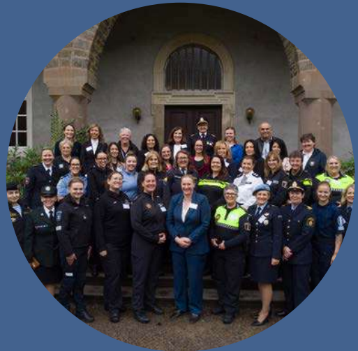
Section Reflections #SHEisIPA Seminar

IPA Moldova at Cyprus National Congress 15