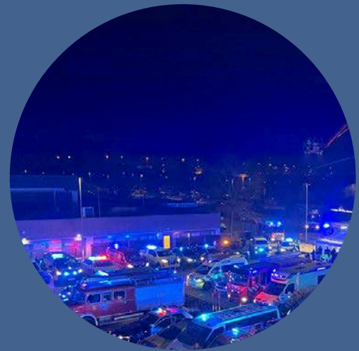
IPA Netherlands Blue Light Ride