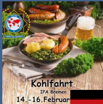
IPA Bremen International Kohlfahrt Event 2025 14-16 February 2025