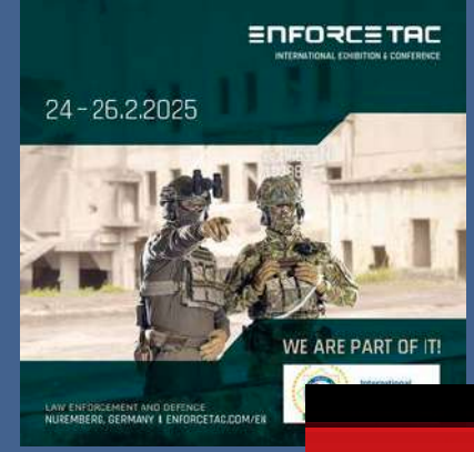
IPA Germany Enforce Tac 2025 24-26 February 2025