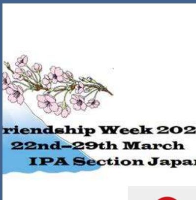
IPA Japan – Friendship Week 2025 22 – 29 March 2025