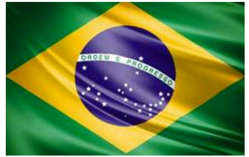
Bandeira Nacional - atual (hasteada em 19/11/1889)

For the Brazilian Section of the IPA, the celebration of Flag Day is a permanent calendar in the Entity's Annual Management Plan. In fact, it is one of the few Brazilian institutions that celebrate this date with emphasis, and this year was no different. However, IPA Brazil chose for 2024 a different celebration to the commemorative style of previous years, and with this we produced one of the biggest events that took place for this celebration in the last 25 years. In addition to setting up a specific area for the event, located at the side of the Museum of the Republic in the capital of the country, Brasília/DF, we seek the participation of children and young people who participate in social groups, such as scouts, junior guards, junior firefighters, the Pathfinders, daycare centres, orphanages, public schools, Jiu-Jitsu and Judo academy, as well as members of schools for Autistic people and other people with physical, hearing and visual disabilities.