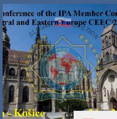
Central & Eastern European Conference (CEEC) April 2025 24-27 April 2025