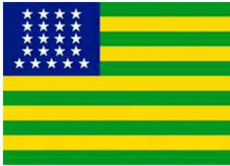
Bandeira provisória da República (15 a 19/11/1889)