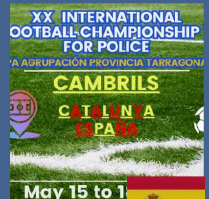
IPA Spain International Football Championship for Police 15-18 May 2025

Here are some of the events taking place throughout the IPA over the next couple of months. Visit our international website for a full list of our upcoming events: