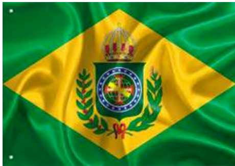
Bandeira Imperial do Brasil (1822-1889)

As a curiosity, Brazil since its discovery by the Portuguese in April 1500 to the present date, has had thirteen representative flags hoisted on its soil, ten of which related to Portugal, and the last three made were in fact Brazilian: that of independence with Brazil-Empire, and two related to the proclamation of the Republic, the first lasting only four days, and the second is the one that lasts until the present time.