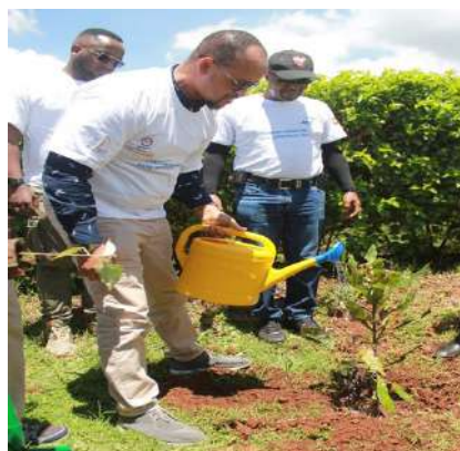
Chief Guest watering his tree