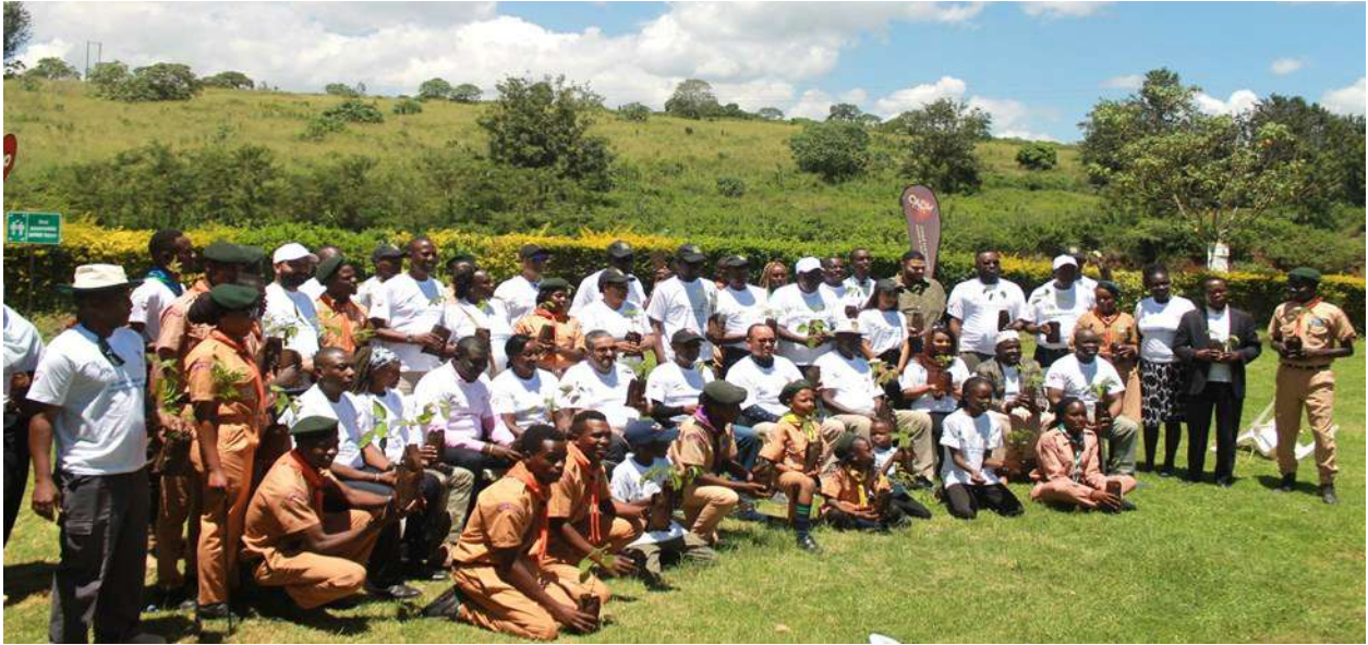
Group Photo: IPA Section Kenya members during the IPA green project launch, 18/4/2024 at Kirigiti-Kiambu County.

The International Police Association Kenya Section in partnership with the National Gun Owners (NGAO) Association of Kenya on Thursday 18/4/2024 launched the IPA nationwide tree planting – The IPA Green project at the NGAO Range, Kirigiti in Kiambu County, in a international event dubbed ‘PLANT a TREE-GREEN IPA’