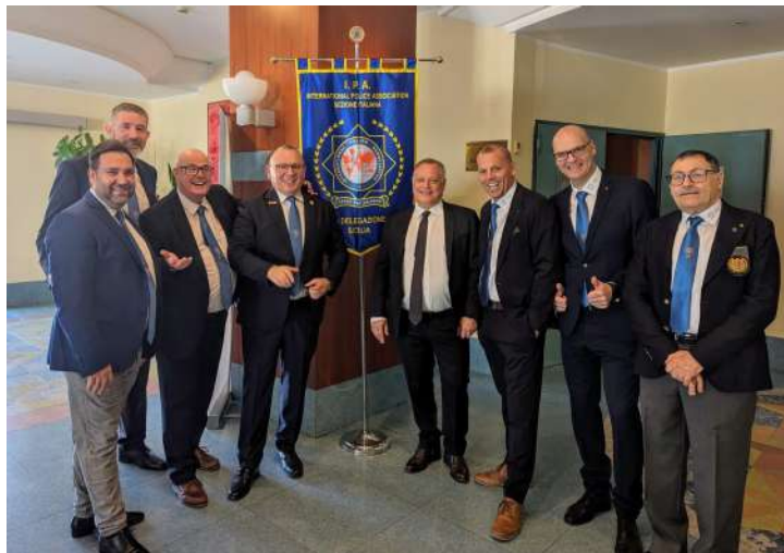
IPA Italy and Region Sicily host the International Executive Board during their national congress and 60th Anniversary of IPA Sicily events in Catania. Read more on page 3