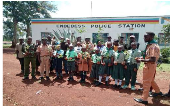
Western Kenya Region IPA members take part in the exercise